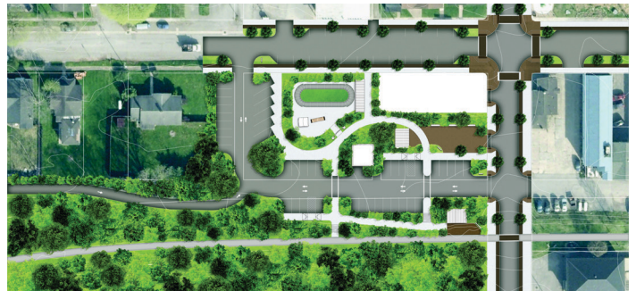
Downtown Trailheads, around Monongahela National Forest

With these examples of regional success, the ANRE platform also engages with national partners in both economic development and conservation to evolve the national dialogue on rural development. The future of rural regions will be one in which the value generated by natural resources can be increased, sustained, and directed to serve the wealth and well-being of residents. In cooperation with national and regional partners, the ANRE platform is positioned to bring this future to fruition.