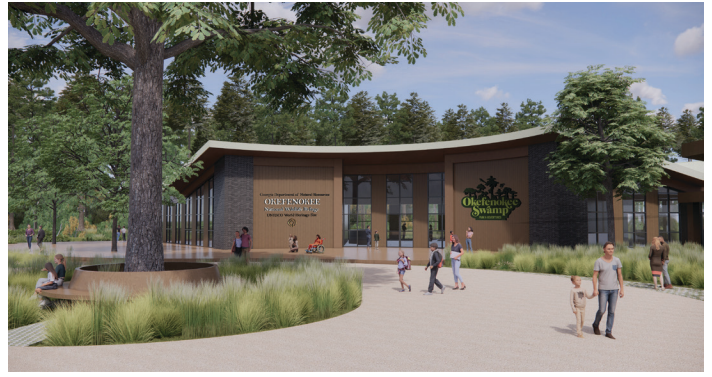
Okefenokee Swamp Visitor Center, Southeast Georgia

A principal aim of the ANRE platform is to generate a pipeline of vetted, shovel-ready projects that serve regional priorities, presenting impact investment opportunities. These projects also receive support through the ANRE platform in the form of predevelopment grants, technical assistance, and strategic real estate acquisitions to support promising projects, leveraging TCF's real estate expertise. Examples of recent and ongoing activation projects with regional partners include: