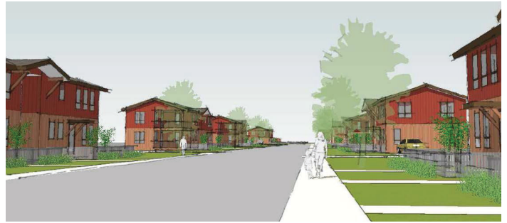
Housing Development, New Hampshire