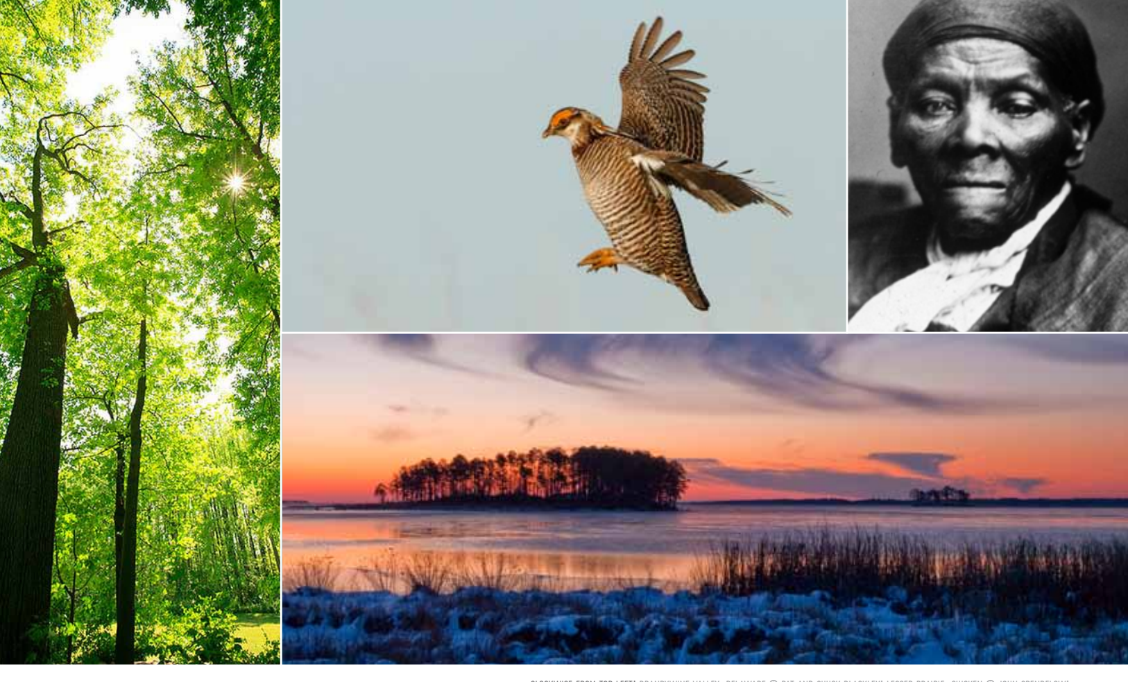
CLOCKWISE FROM TOP LEFT: BRANDYWINE VALLEY, DELAWARE; LESSER PRAIRIE—CHICKEN; HARRIET TUBMAN; MARYLAND'S EASTERN SHORE