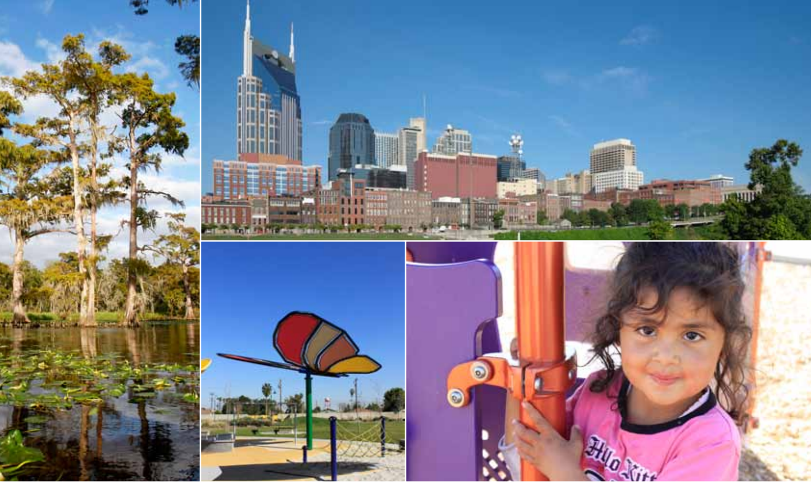
CLOCKWISE FROM TOP LEFT: MAUREPAS SWAMP WILDLIFE MANAGEMENT AREA, LOUISIANA ; NASHVILLE, TENNESSEE ; GIBSON MARIPOSA BUTTERFLY PARK, LOS ANGELES, CALIFORNIA ; GIBSON MARIPOSA BUTTERFLY PARK, LOS ANGELES, CALIFORNIA