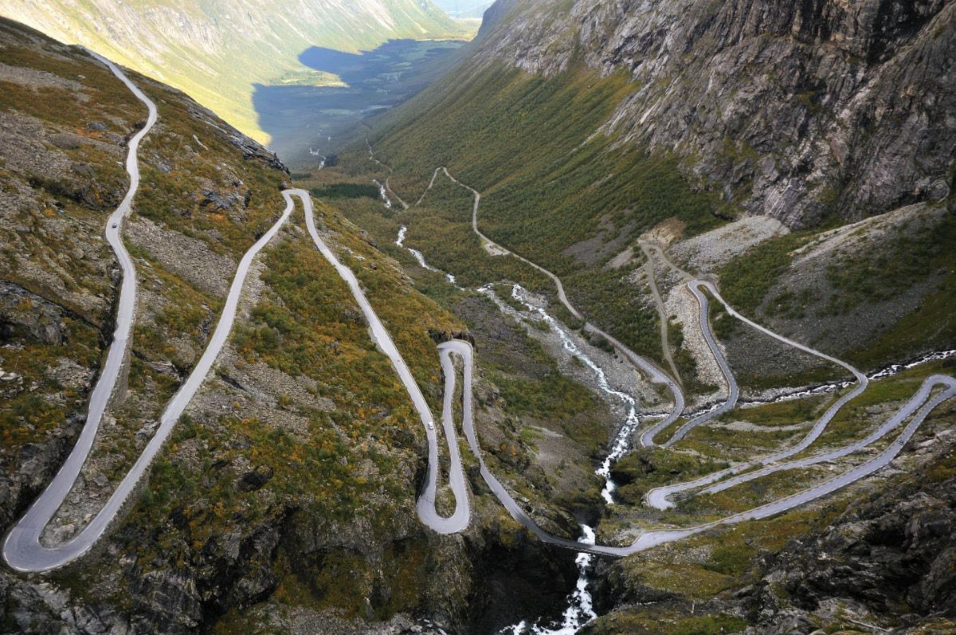
Trollstigen Road, Norway