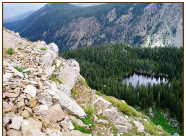
FLTFA project: White River National Forest and Holy Cross Wilderness in Eagle County. Through FLTFA funds, USFS protected 75 acre property from threatened development. Property includes portions of the popular New York Mountain and New York Lakes trails.